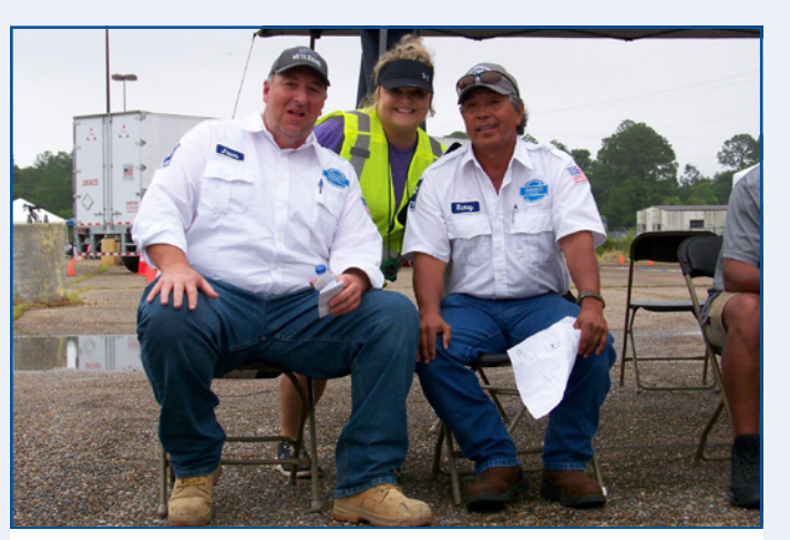
Waiting to Go