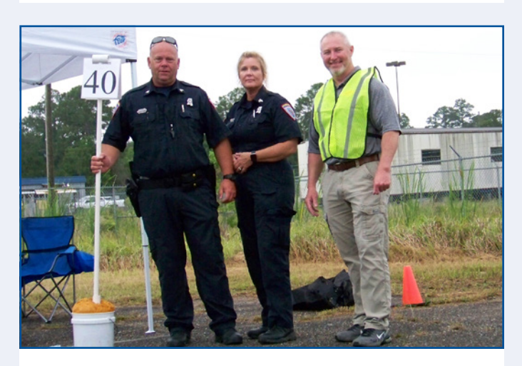
We appreciate our volunteers!