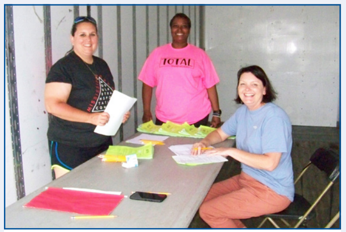
Thank you to our volunteers!