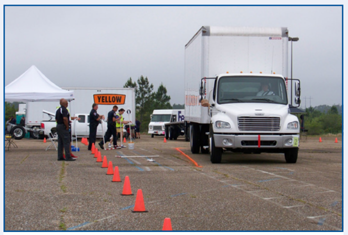
Running the Course