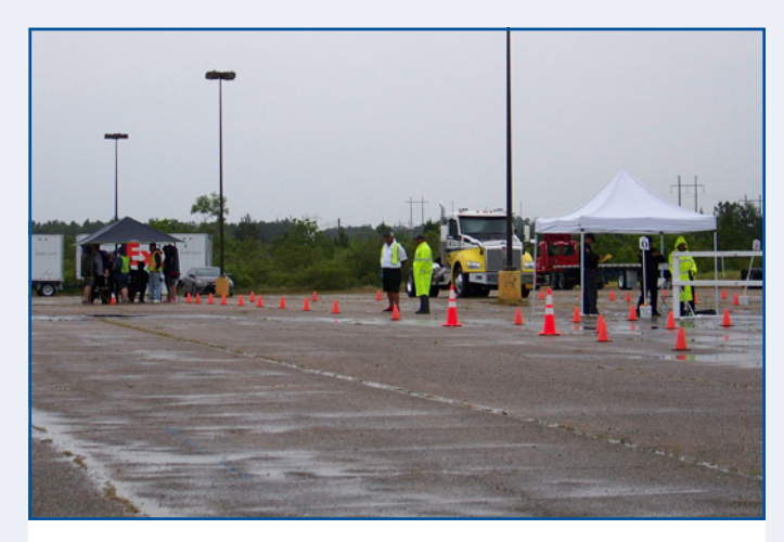
A little rain won't dampen our spirits!