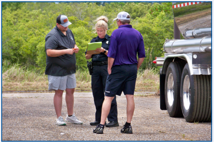
Passing all the Tests