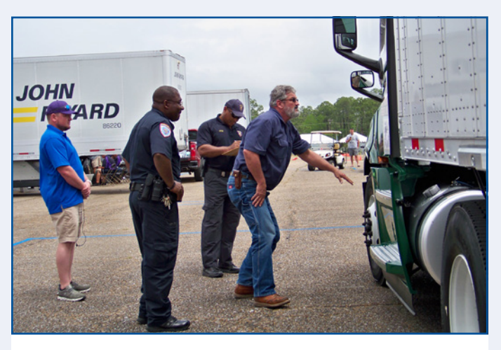
Under the Watchful Eye