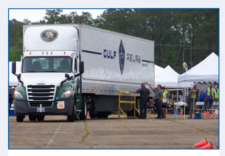
Making the Turn