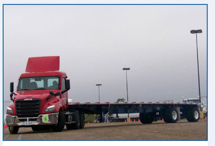
Here we go!