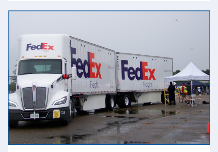
Back in Action