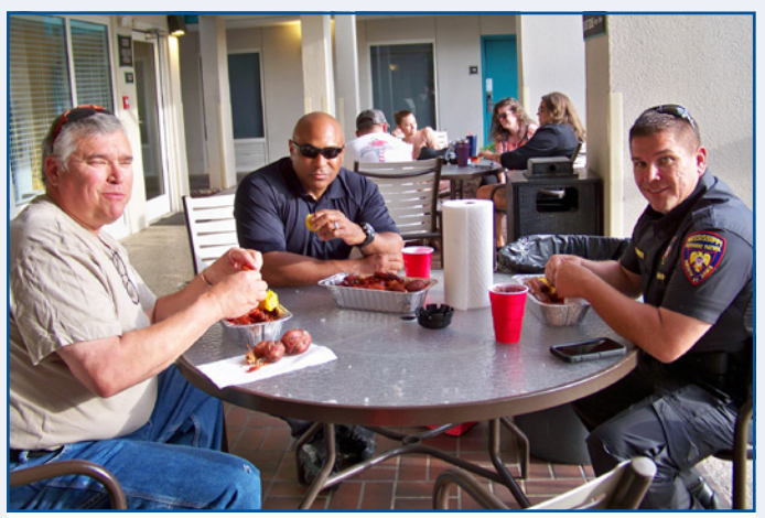
Thursday Crawfish Boil