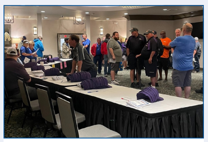
Waiting Our Turn to Register