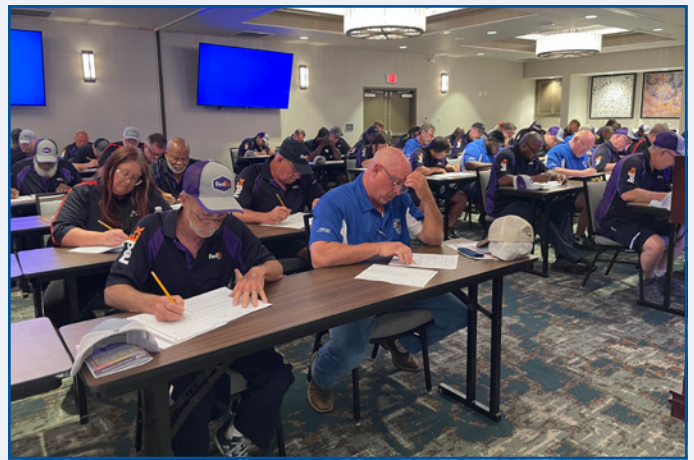
We've Got This!