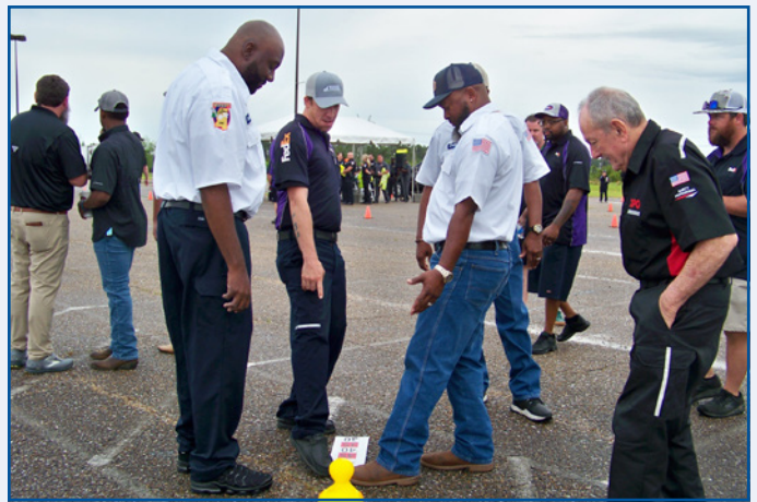
Assessing the Situation