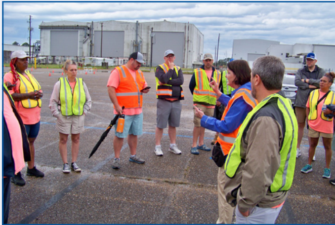
Volunteers are Well Prepared!