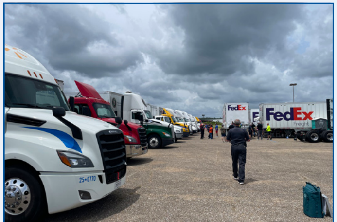
A Few Storm Clouds Won't Stop Us!