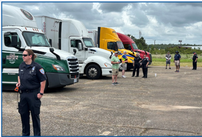
We Appreciate Our Volunteers!