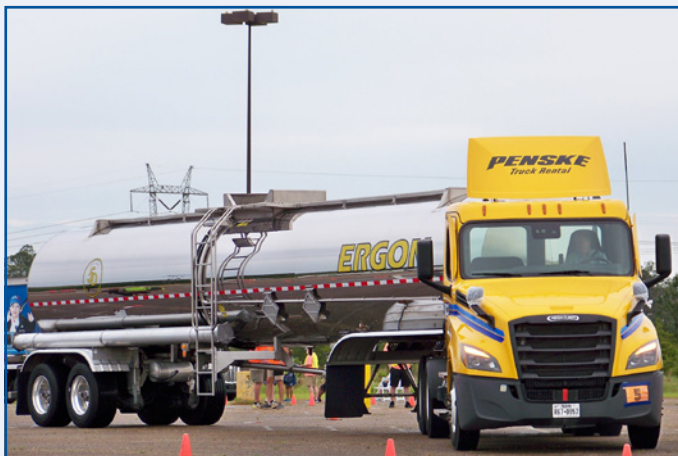
Running the Course