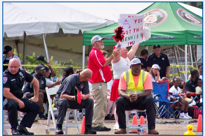
The Best Cheering Spectators!