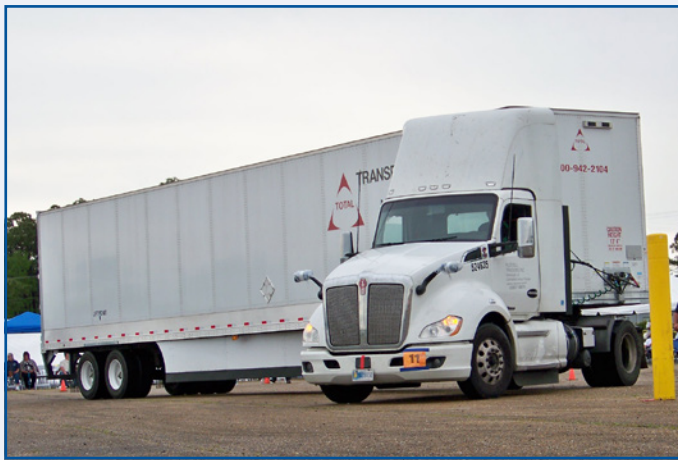
Precision at Its Best