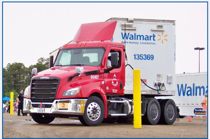
Passing All the Tests