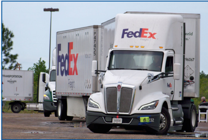
Making the Turn