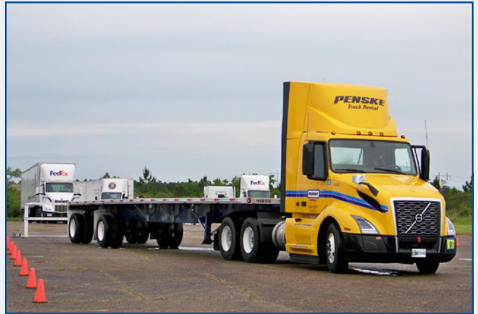
Let's Do This!