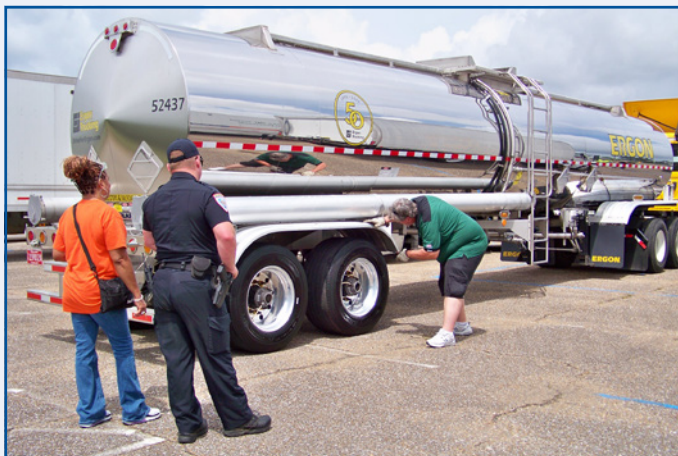
Under the Watchful Eye