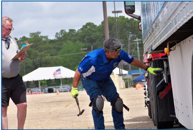
Nothing Gets Past These Guys!