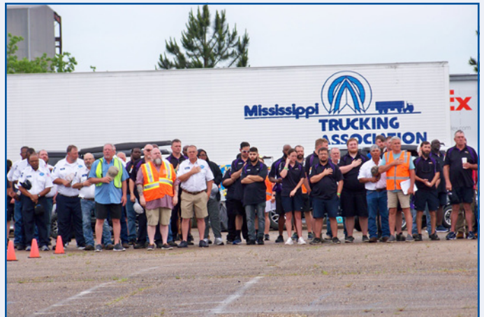
Proud to Be an American!