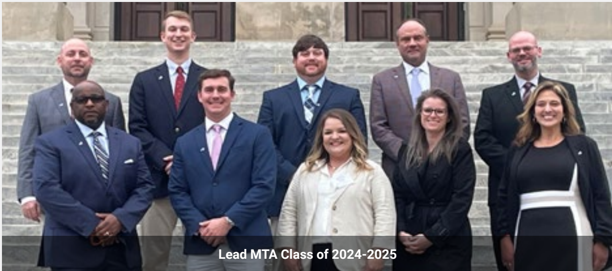
Lead MTA Class of 2024-2025

2025-2026 UPCOMING LEAD MTA APPLICATION NOW AVAILABLE