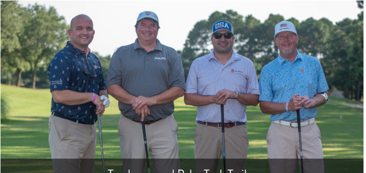
Truckworx and Polar Tank Trailer